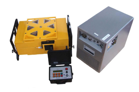
Fig. 1.2 A compact modern betatron X-ray source (yellow, left) and its power supply and control units [5]. The window is visible tho the front with an alignment laser on its left.